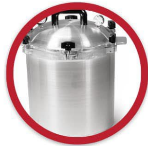
All American 25 - Quart Pressure Canner with 3 Canner racks