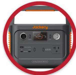
Jackery Portable Power Station