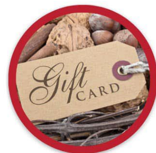
$500 Kent Outdoor Gift Card

To enter this draw you must enter in the four draws listed below on the Sts'ailes Qép Sí:tel Facebook Page (scan the QR code to join the new page);