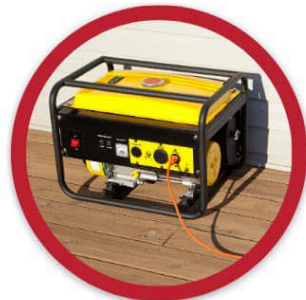
Firman 5-Gallon Gas 3550W-4450W Generator