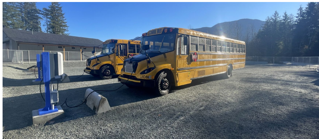
Our new electric buses!

Sts'ailes Education Department Naming Ceremony - The department is planning a celebration to recognize the many people who were committed to building the Sts'ailes Education Department. To honor those who gave so much the school will be naming the stand alone classrooms and IE shops as well as christening the buses. A date for the ceremony will be coming soon.